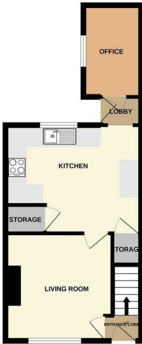
GROUND FLOOR 386 sq. ft. (35.8 sq.m.) approx.